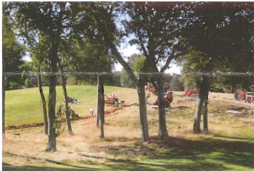
(Irrigation project currently underway)